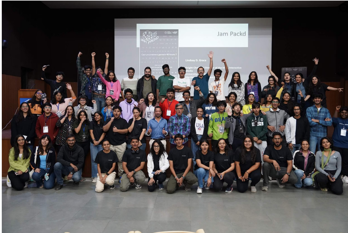
Anant National University Hosts' JAM PACKD' –A 48-Hour Gamethon for Social Change